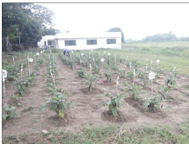
Figure 2. Experimental Setup